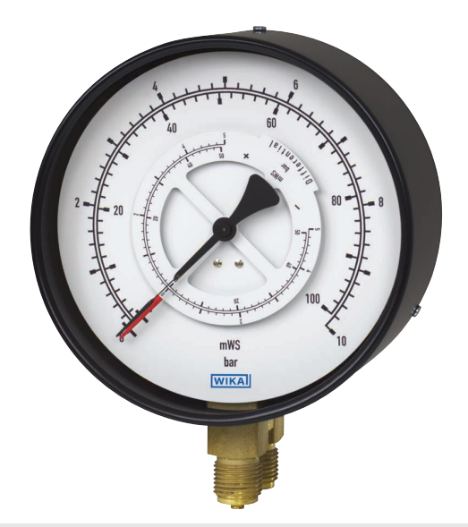
Differential pressure gauge model 711.12